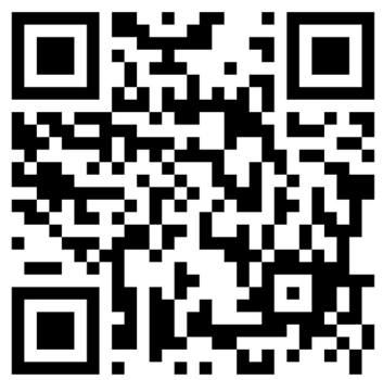
2023-2024 PTO BOARD

We recognize that others may have wanted to attend, but personal schedules simply would not allow. If you are interested in filling one of the positions (president, vice-president, secretary, treasurer), please use the QR code and complete the form.