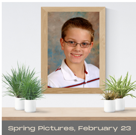
Spring Pictures, February 23